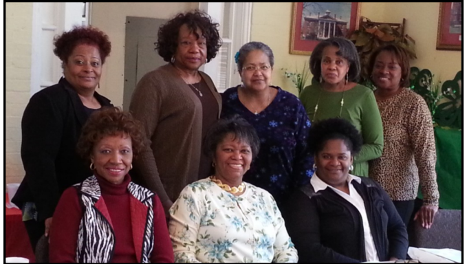
West Central GA CARE-NET hosting some caregivers in there area. Things are happening there!