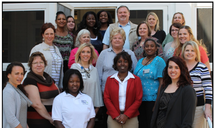
Coastal GA CARE-NET recently meet to discuss plans for the upcoming year, stay posted!

Georgia CARE-NET Coalition Newsletter is a publication sponsored by the Rosalynn Carter Institute for Caregiving . "The Advocate" is designed to support and promote the work of Georgia's 12 CARE-NET s.