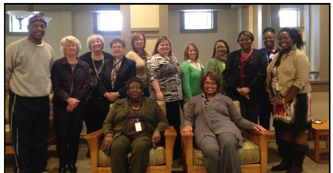
SouthWest GA CARE-NET meeting from January.