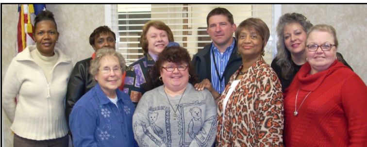
Central Savannah River Area CARE-NET committee making plans for the year. They would love for you to join them.