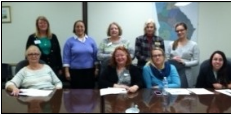
Northeast GA CARE-NET held their quarterly meeting