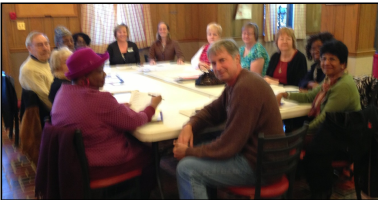
Middle Georgia CARE-NET having their planning session. They will be hosting their next caregiver event in Baldwin County. We can't wait to hear about it!